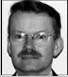
Graham Page 462 508

For addresses and more details see TWPC website: www.thanington-pc.gov.uk