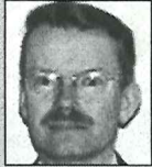
Graham Page 462 508

For addresses and more details see TWPC website: www.thanington-pc.gov.uk